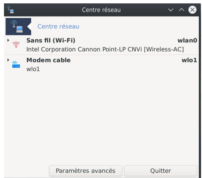
Figure 2: Screenshot with Ethernet adaptor unplugged

Moreover, the line “Sans fil (Wi-Fi)” is blinking.